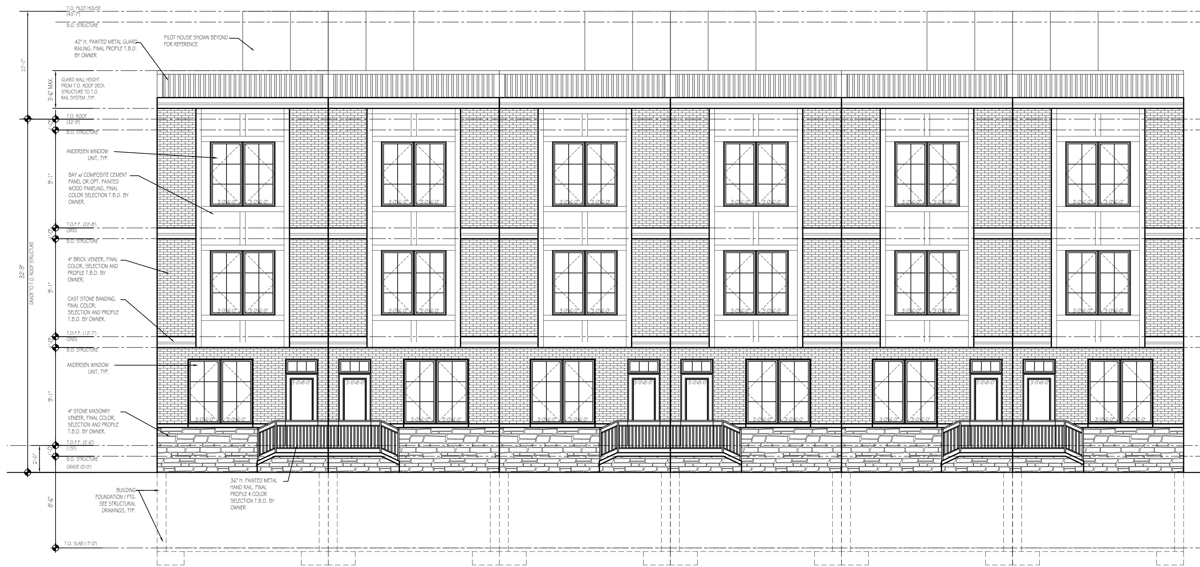
1 FRONT ELEVATION Z-2 SCALE: 3/16"=1'-0" MANAYUNK AVE