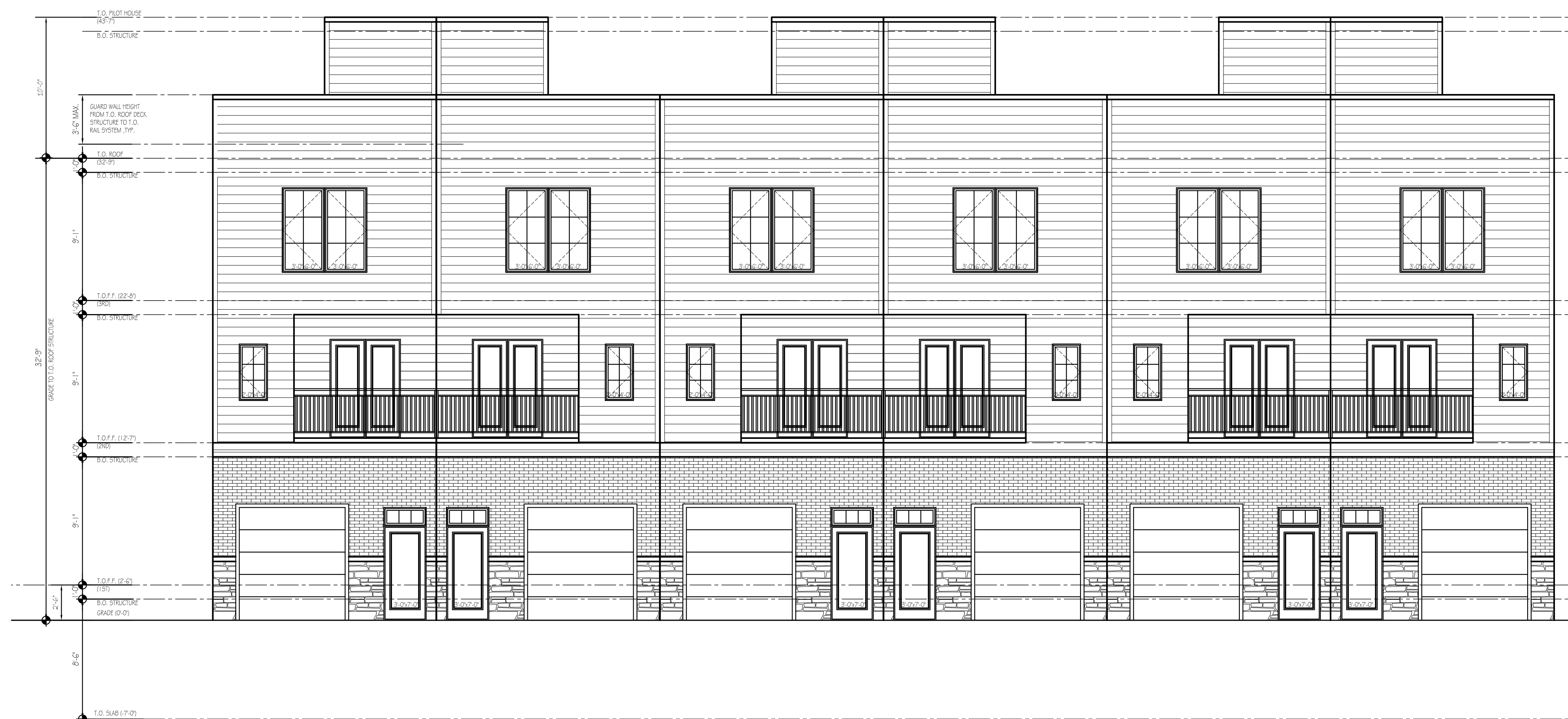
2 REAR ELEVATION Z-2 SCALE: 3/16"=1'-0" DRIVE AISLE